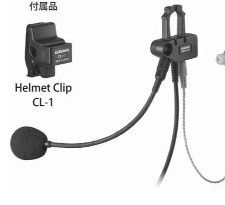
付属品 Helmet Clip CL-1